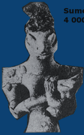
Sumerian Statue. 4 000 years BC, Irak.