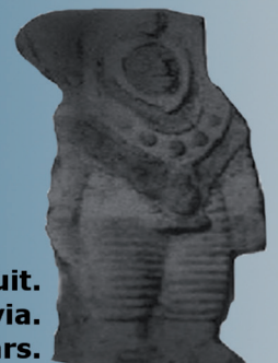
Statue dressed in a jumpsuit. Ecuador / Bolivia. 3000 years.