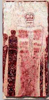
Aboriginal cave paintings, more than 5000 years old, Australia