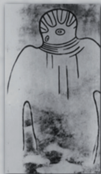
Aboriginal cave paintings, more than 5000 years old, Australia

In parallel with these astro-archaeological studies, the UFO files remain an important strategic research objective for the Phenix Project. These files are a collection of credible evidence and observations (ground materials, radar recordings, physical, chemical and spectroscopic evidence for the existence of UFOs) with potentially important repercussions for human society – particularly in the search for alternative energy sources.