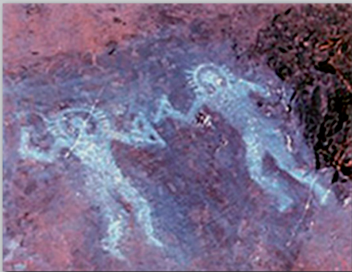
Rock paintings. 10,000 BC. J. C. Valcamonica, southern Italy

Traditional SETI research is based upon the search for non-natural electromagnetic radiation reaching the earth, emanating from advanced civilisations from outside our own solar system.